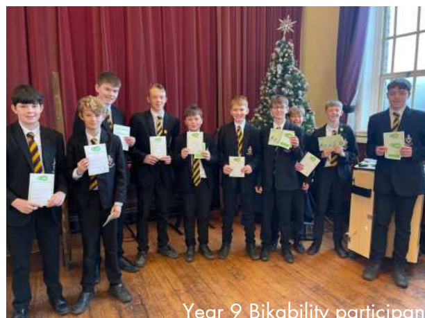
Year 9 Bikability participant

Well done to the 42 students across the school who have complete their bikeability level 3. The course, run in partnership with South Ribble, teaches pupils how to be safe, independent and confident on the road.