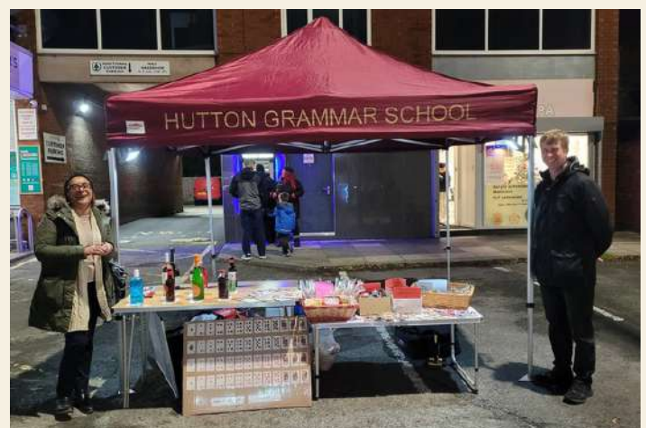
Penwortham Christmas Market