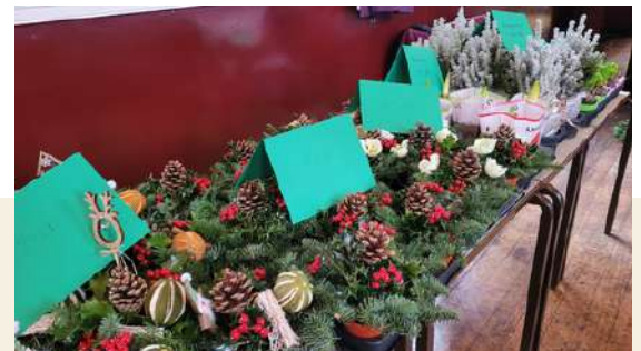
The Christmas Fair