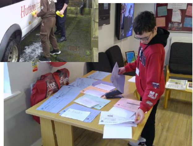
Year 10 pupils helping in school