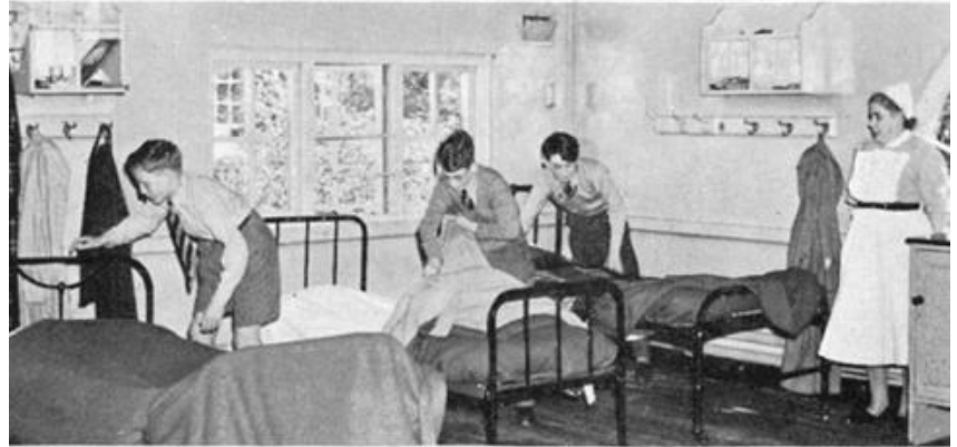
Boarders making their beds before the start of school