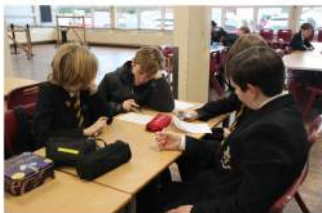
Above - 7R Below - overall winners, 10H

Well done to all of the boys who competed!